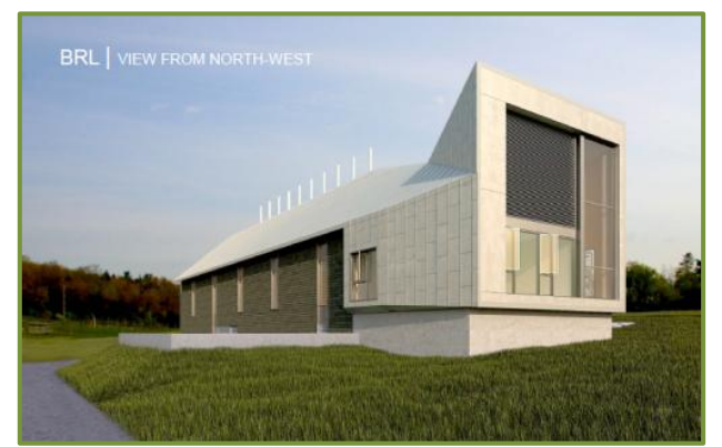
Figure 1 - Courtesy of Payette Associates

The Animal Biological Safe Laboratory went through a lot of different designs due to the source of funding as well as taking into account the complex and one of a kind facility. Many BSL-3 facilities (Biological Safety Laboratory) across the country are modular built making it easier to construct the